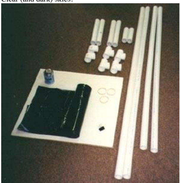
To build a 6.5 foot x 5 foot light shield, you need the following: General equipment:

Three of these devices have been successful at shielding me from all of the lights above and all car lights going by my house. I can now remain with dark adapted eyes for hours in my neighborhood. If you make a shield this way, please e-mail me with comments and suggestions for improvements. Clear (and dark) skies!